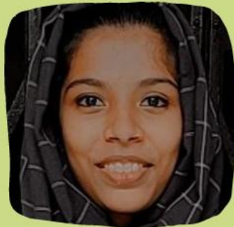
IRFANA T H II DC HOME SCIENCE