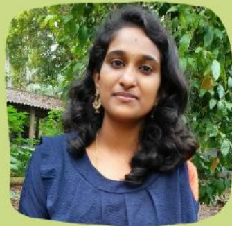
ANAMIKA S. II DC B.VOC FOOD PROCESSING TECHNOLOGY