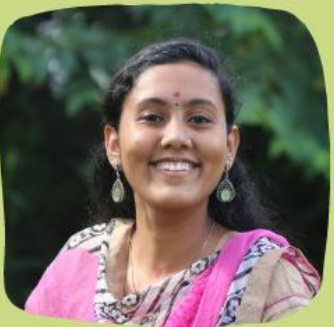
K J SREDEVI II DC B.VOC FOOD PROCESSING TECHNOLOGY