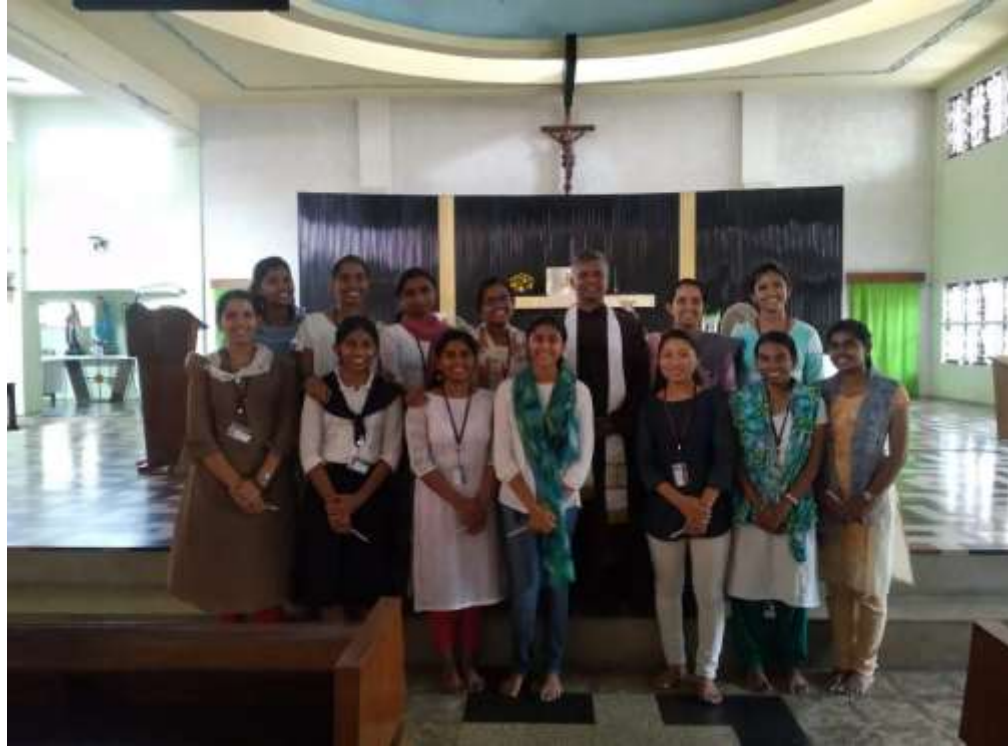
Core Team 2020-2021