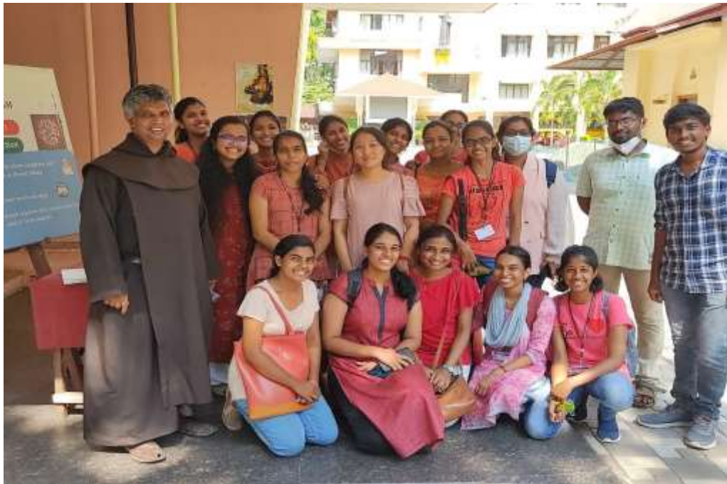
Newly anointed Core Team 2021-2022