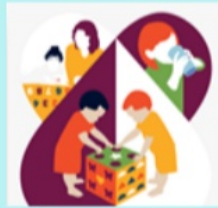
Early intervention/ stimulation