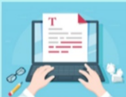
Development of Early Childhood Curriculum & As Early Childhood Educators